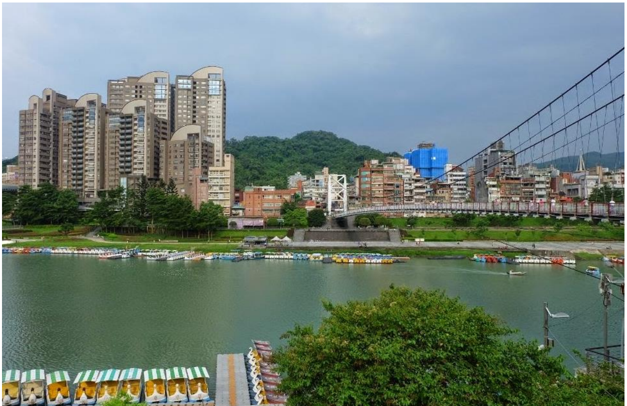
Side view : Bi-tan racing venue