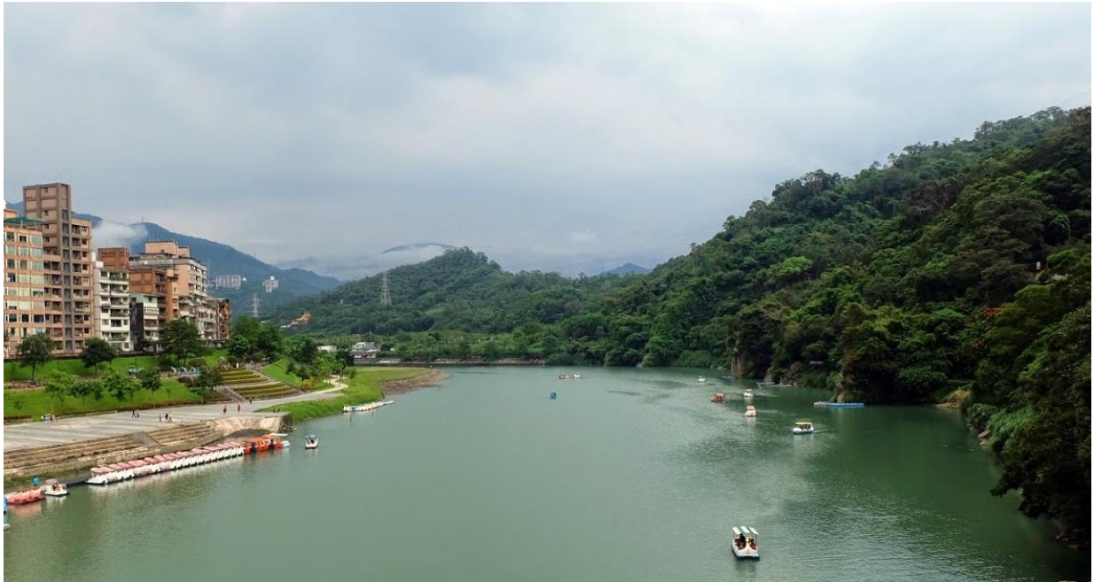
Front view : Bi-tan racing venue