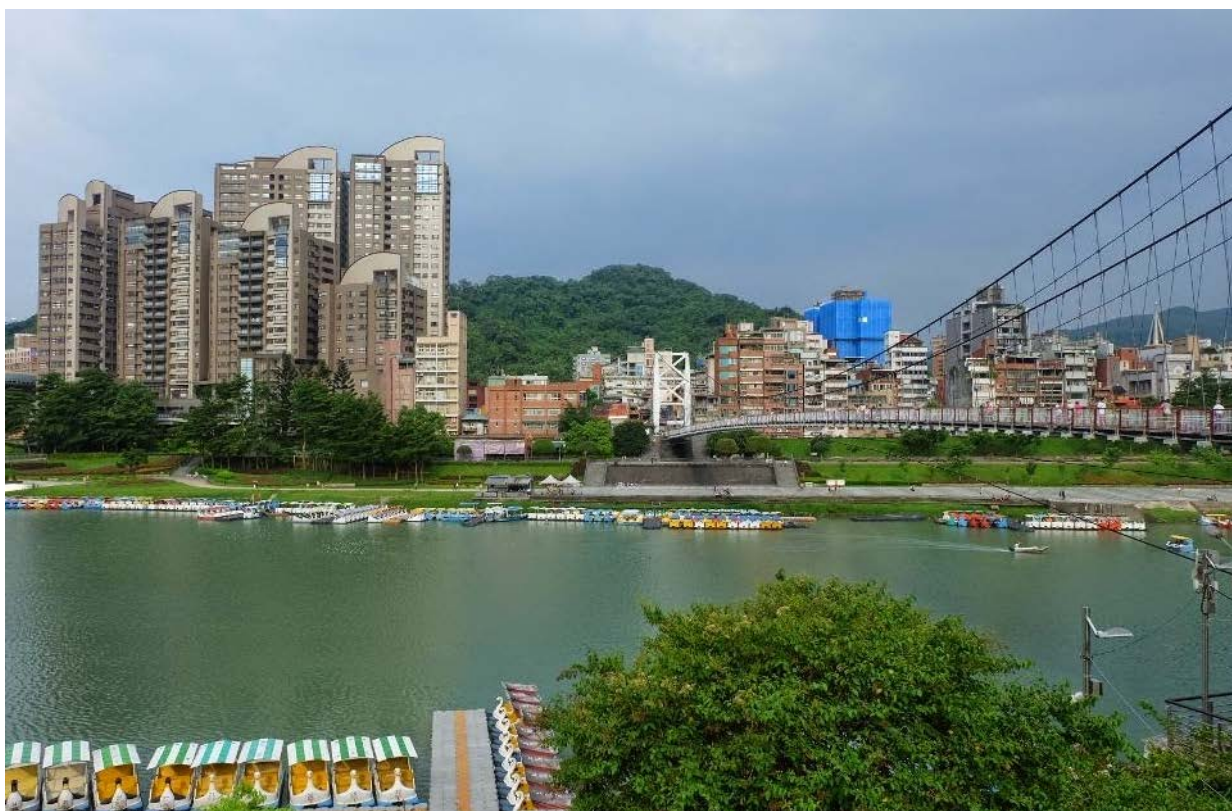
Side view : Bi-tan racing venue